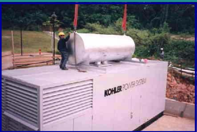
1500kVA KOHLER generator set with EN-SYST 85dBA @ 1m Sound Proof Enclosure