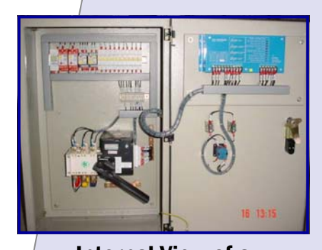
Internal View of a Transfer Switch