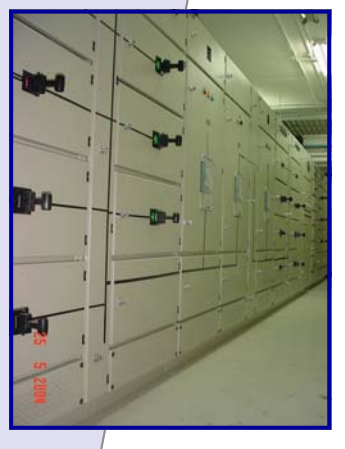
Switchgear and Switchboard