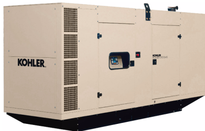
With Available Enclosure Accessory