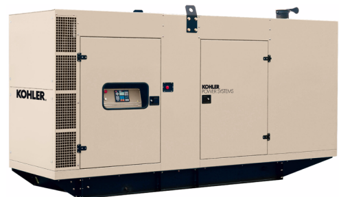
With Available Enclosure Accessory