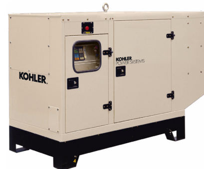
With Available Enclosure Accessory