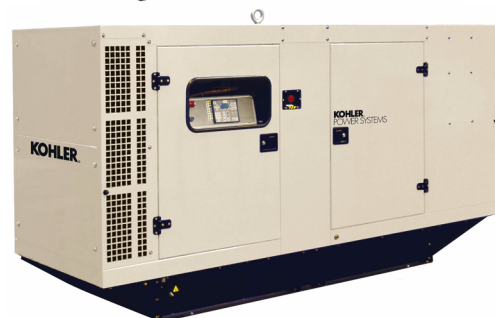
With Available Enclosure Accessory