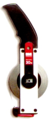
Plastic Tape (Glass fiber with yellow)

173N43 = white enamelled, 173N43 = high-etched)