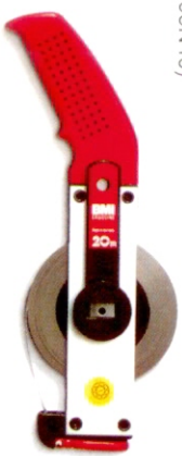
Non Coated Steel Tape (ISOLAN) 30, 50 m.