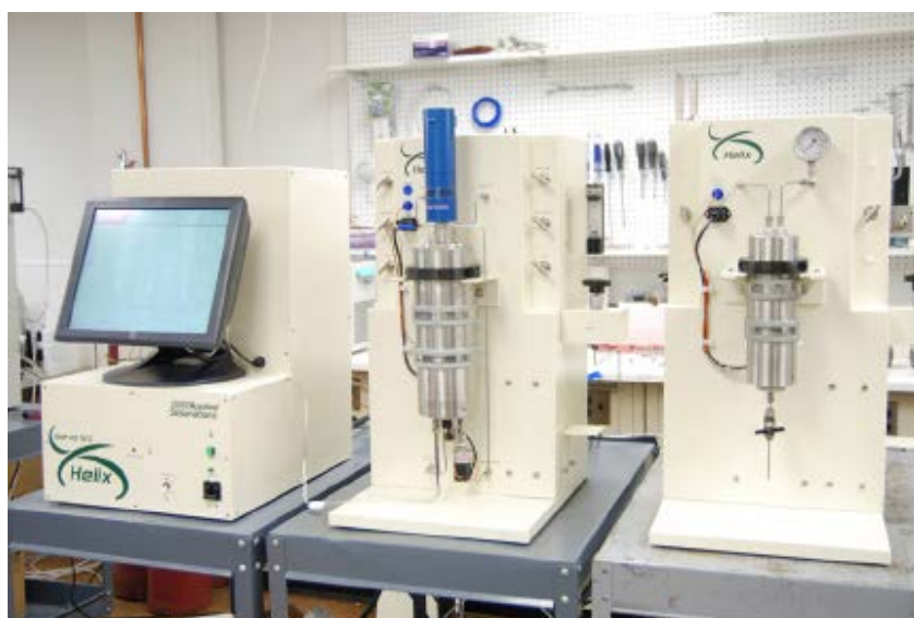
Basic Helix system with the separator module.