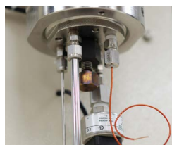
Close-up of the top and bottom vessel ports.