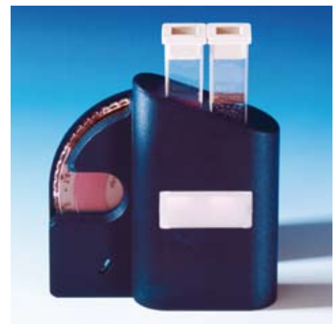
Rear view of the CHECKIT® Comparator with disc, diffuser and cells