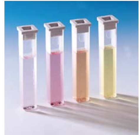
Plastic cells, frosted on two sides, volume 10 ml, path length 13.5 mm, with lid