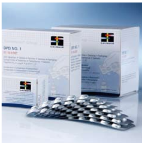
Tablet reagents in foil blister strip