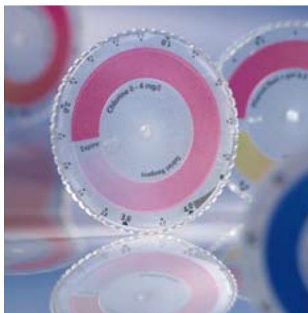
CHECKIT® Discs with continuous colour scales