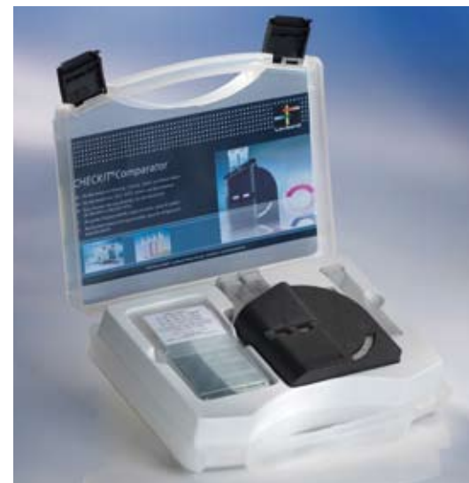
Test Kit complete in case