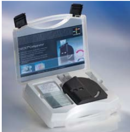
Test Kit complete in case