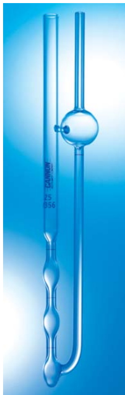
9721-E50 Series 9721-F50 Series