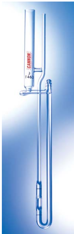
9723-S50 Series 9723-U50 Series