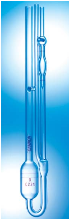
9721-N50 Series 9721-R50 Series 9721-U50 Series