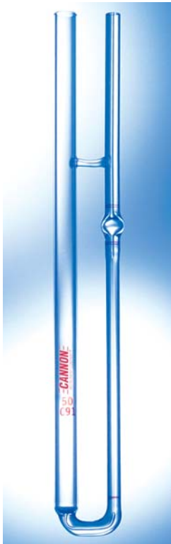
9721-X50 Series 9721-Y50 Series