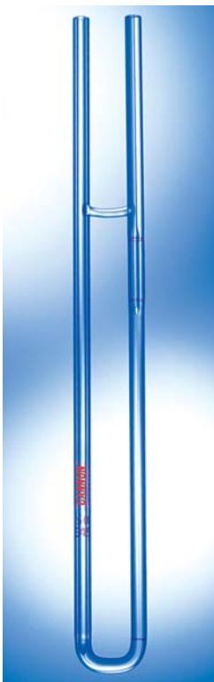
9722-C50 Series 9722-D50 Series