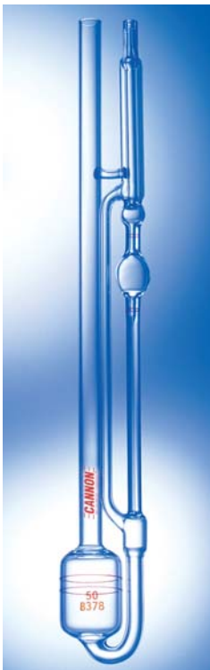
9721-J50 Series 9721-K50 Series

Holder is not supplied. For holders, see 9726-M70, -M73, and -M76 on page 15.