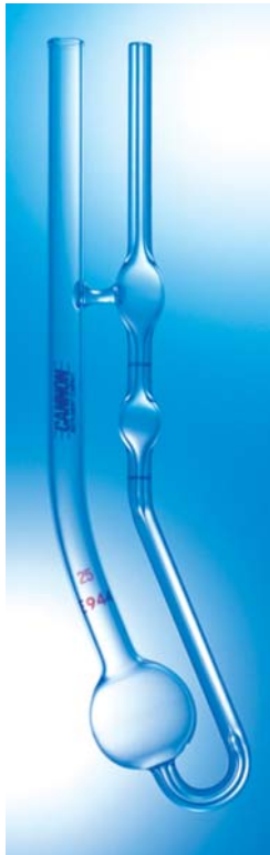
9721-A50 Series 9721-B50 Series